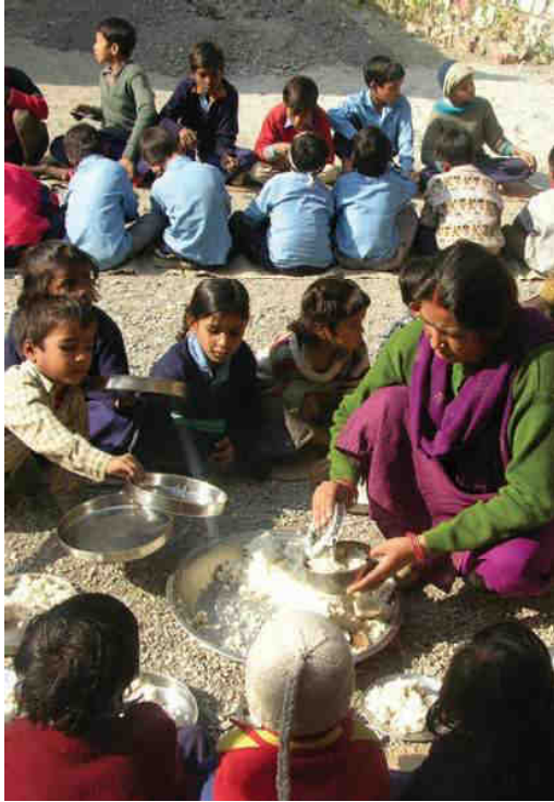
Children being served their midday meal at a government school in Uttarakhand.

What is the midday meal programme? Can you list three benefits of the programme? How do you think this programme might help promote greater equality?